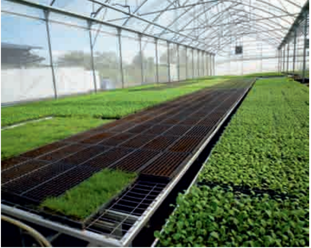
Modern automatic seed sowing and mass production of seedlings to raise production efficiency