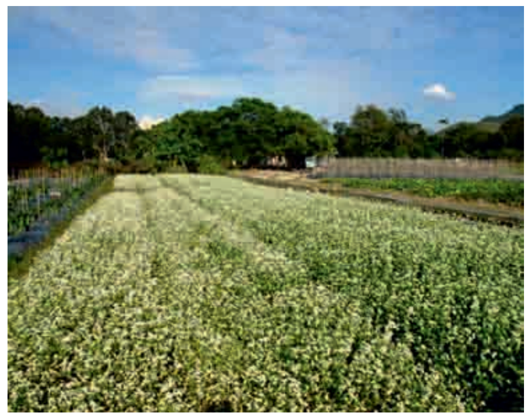
Incorporating the cultivation of Buckwheat as green manure in planting cycles for improving soil in an organic farm