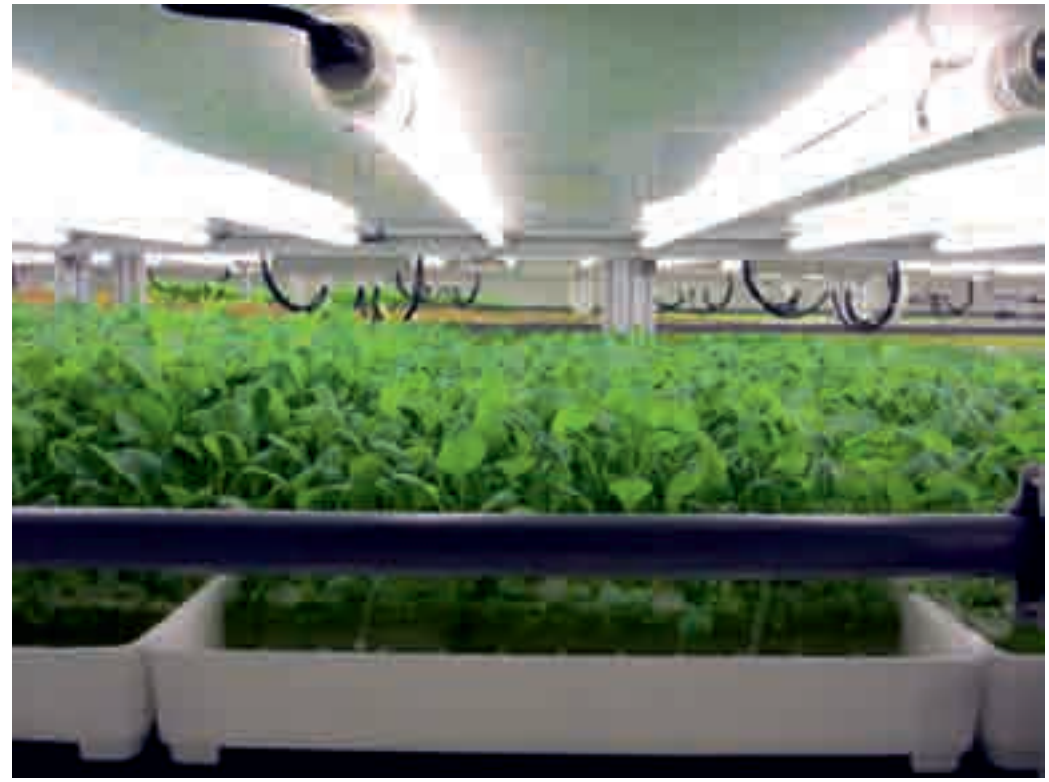
Modern multi-tier hydroponic production in enclosed environment for optimal efficiency and contamination free produce