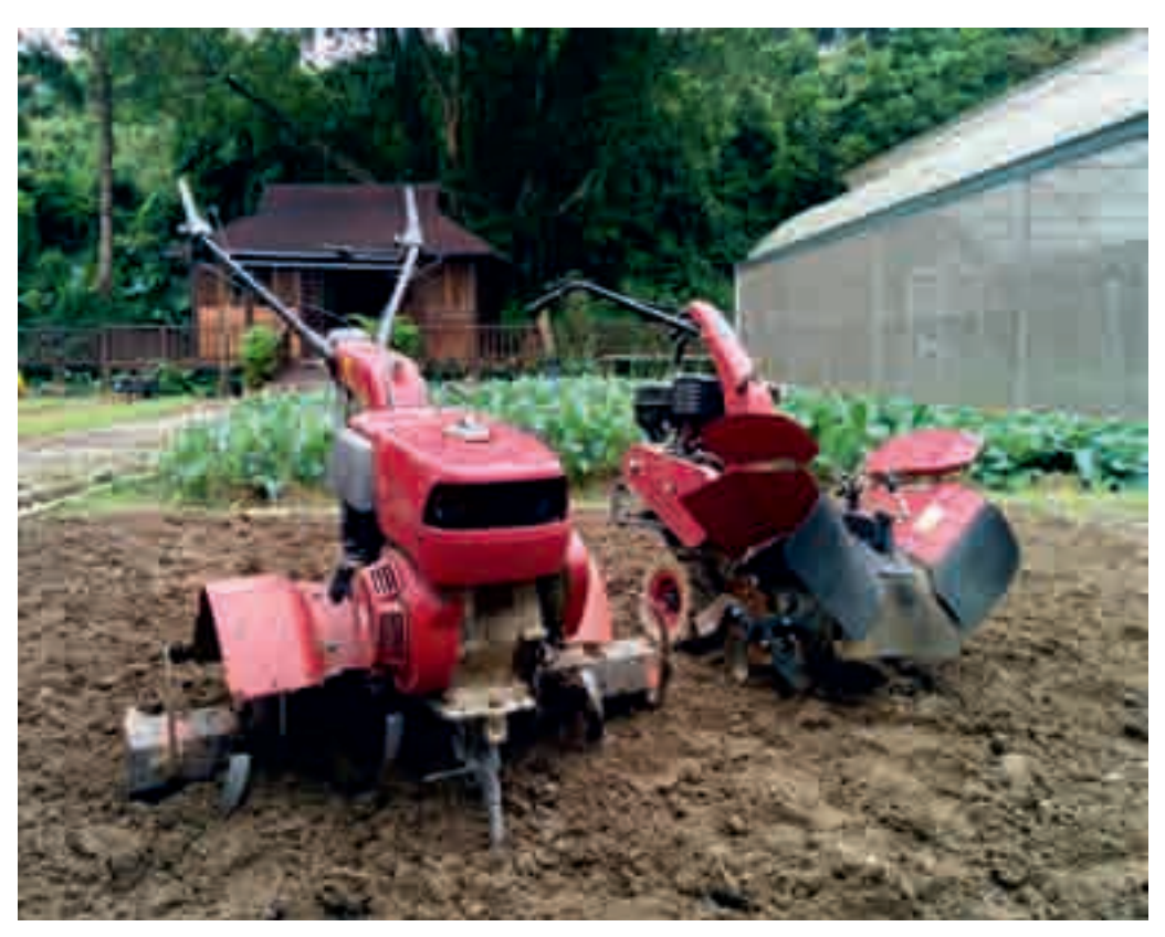
Handheld farming machinery suitable for the typical small family farms in Hong Kong

4.22 We therefore propose to set up an SADF to provide the necessary financial support to facilitate the development of modern, sustainable and urban agriculture in Hong Kong. The SADF will provide funding in the form of grants for scientific as well as adaptive research and studies, such as those on technology development and demonstration. It will also support the transfer of knowledge and training, improvement of agricultural infrastructure, development of local brands and related promotional activities, and exploration of new marketing channels. It will seek to assist individual farmers to modernise their farming equipment and facilities to scale up production and to improve on efficiencies. addition, it may provide matching grants to entrepreneurs to propel the adoption of new agricultural practices to raise productivity, improve sustainability or diversify local production.