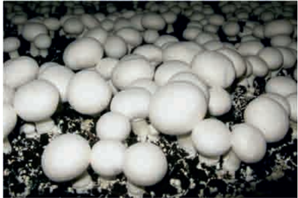
Modern mushroom cultivation under controlled temperature, humidity and light intensity