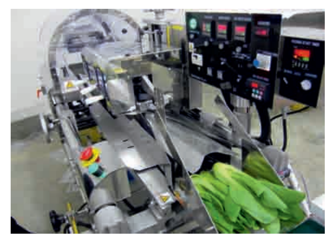
Machine packing vegetables for brand marketing

4.28 Weekend markets and farmers' festivals are other effective ways for farmers to market their products. The annual Farmfests and the various weekend markets currently in operation have been well received by local farmers as well as consumers. Through them, farmers can directly link up with consumers, and save on transaction costs. AFCD will continue to explore the feasibility of setting up more weekend markets in more districts.