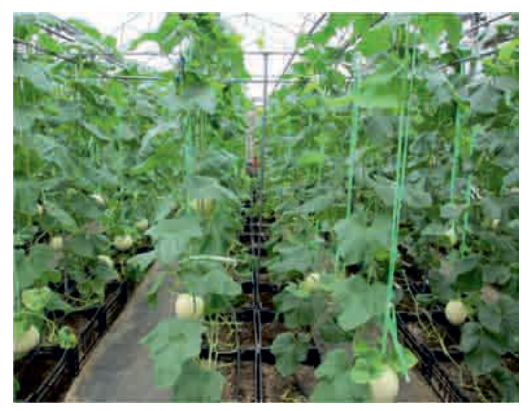
Cultivating high value organic produce in greenhouse