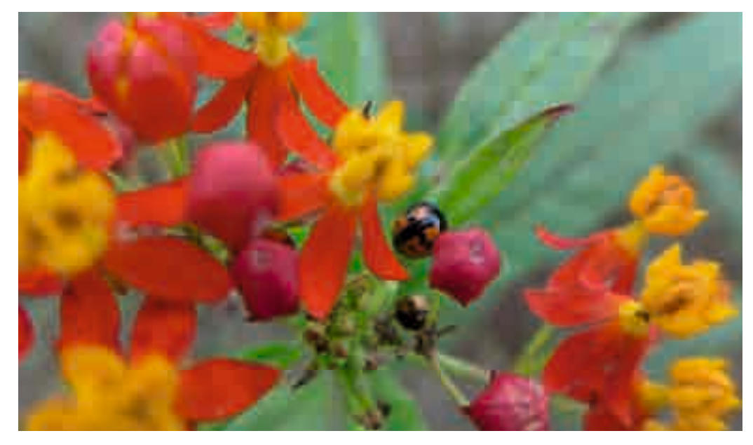
Planting Milkweed as companion to attract beneficial insects (Ladybird Beetle in this case) to prevent plant pests in organic farming