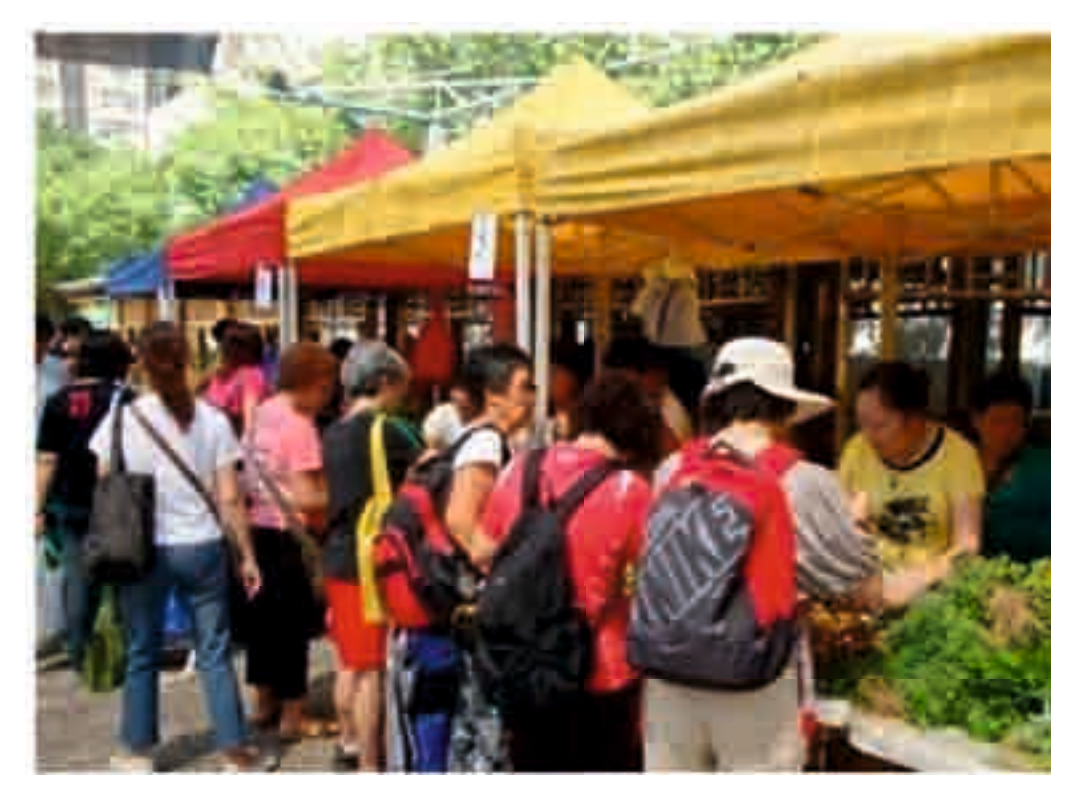
Weekly farmers market at Tai Po

4.29 In supporting the further development of local agriculture, AFCD will strengthen liaison with the various stakeholders involved, i.e. academics and researchers, industry associations and representatives, agricultural entrepreneurs and mainstream farmers, as well as