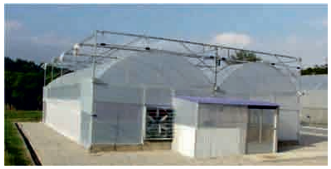
Using greenhouse to protect crops against inclement weather